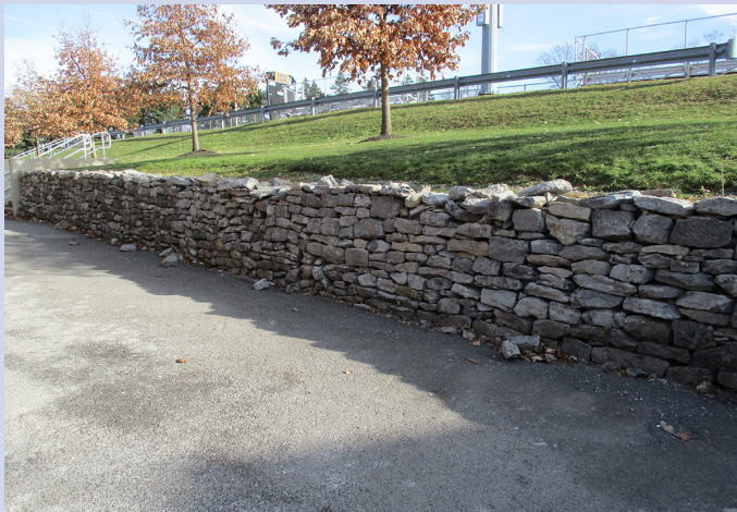
Replace exterior stone retaining walls.