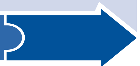
DIAGRAM & PHOTOS DEMONSTRATING NEEDS

A: There will be no increase to the tax bill due to this project.