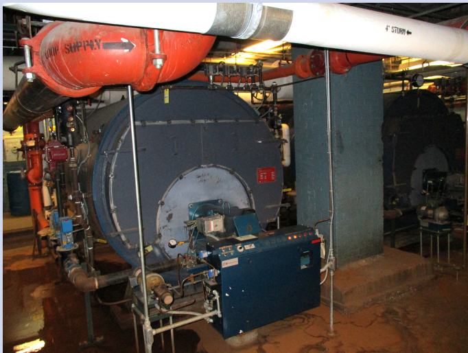
Recondition boilers and controls.