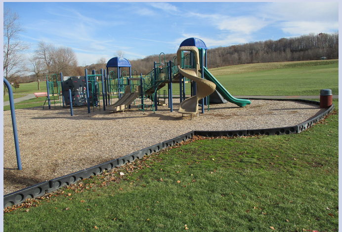
Replace surface of large playground area.