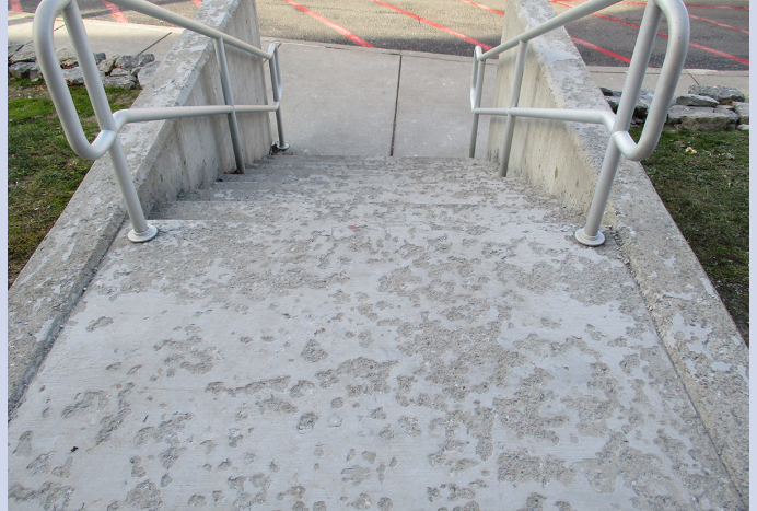
Repair / Replace damaged concrete steps