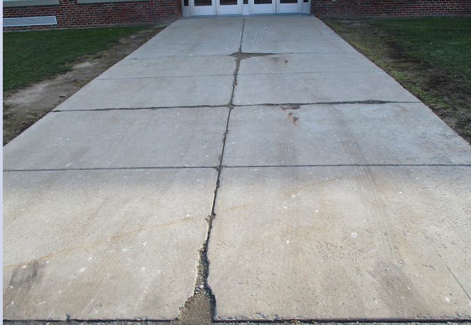
Replace damaged concrete walkways.