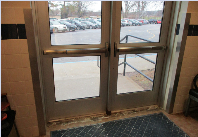
Renovate exterior doors and frames; apply safety film.