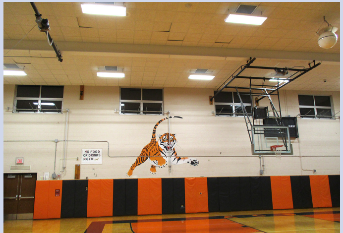
Replace windows in High School Gym 2.