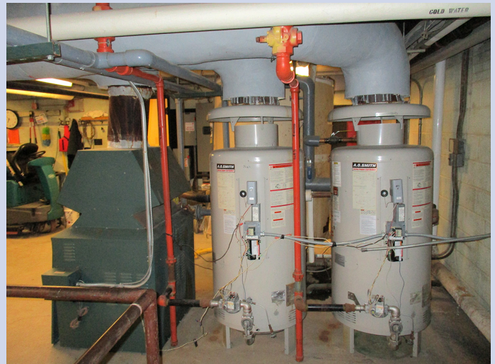
Replace Domestic Hot Water storage tanks in pool heater room and recondition DHW system in elementary school.